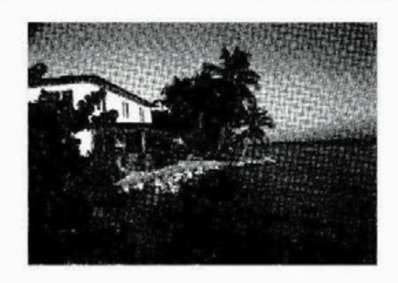
MAIN BUILDING-COCO VIEW

As one might expect for a place so isolated on the isle of Roatan, this is no resort at which to luxuriate. The rooms are small and basic; two single beds, a reading light, a bench for stacking stuff, some shelves for storage, and