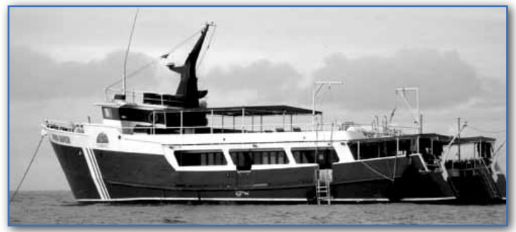
The Wind Dancer

mended that I (and another couple) arrive in Trinidad a day early to avoid catching the last connecting flight to Tobago and risk missing the Wind