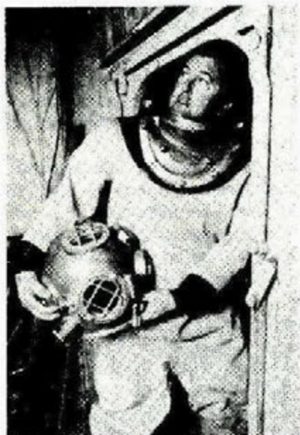
CAPT. NEMO ENTERING HIS DIVING LOCKER

Along with this outrageous splendor is a feature only for divers. Next to the wine cellar (where hundreds of bottles of fine wine are stored at the ambient temperature of the Bay) is a diving locker. One need only step inside, pull the handle to form the seal, and with the aid of a few pounds of compressed air he can enter or leave the island from below.