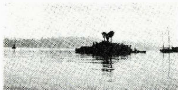
FORBES ISLAND, SAUSALITO CA