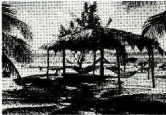
THE GROUNDS AT PIRATE'S POINT

After Sam had our baggage placed in our rooms, he explained that the bar was a "do-it-yourself" affair: mix your drink and record it on a card with your name on it. Breakfast would be from 7:30 to 9:00, lunch from 12:00 to 2:00, and dinner 6:30 to 8:00, (which turned out to be 8:30). A bell would be rung when