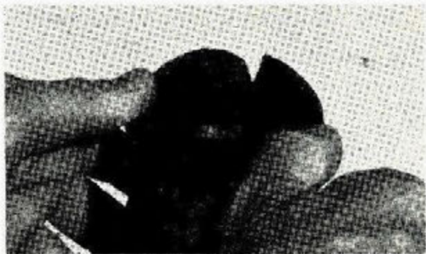
THE TORN HEEL