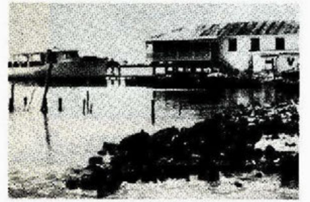
TRUDY HOTEL & DIVE BOAT

On our first morning we left the dock at 8:45 a.m. to dive Black Coral Wall, 25 minutes from the Hotel. Beginning at 25 feet and dropping to 200 feet, the vertical wall was covered with dense growths of gorgonia, whip, white, black and pillar coral, barrel, basket, tube, and wall sponges. I was reminded of the beauty of Bonaire. Brain coral was splashed with colorful Christmas tree worms and small feather dusters. All the normal tropicals